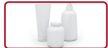
Cartons & Bottles